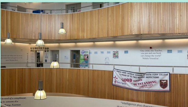
Careers Fair @ St Thomas More School